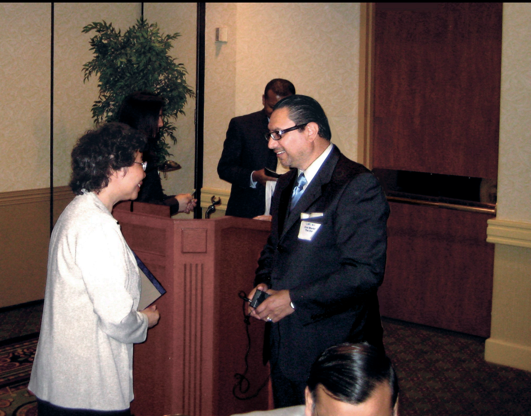
CAREER FAIR BREAKOUT SESSION 1