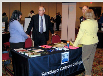
Santiago Canyon College