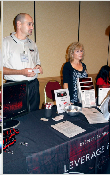
Leverage Point, Gold Event Sponsor