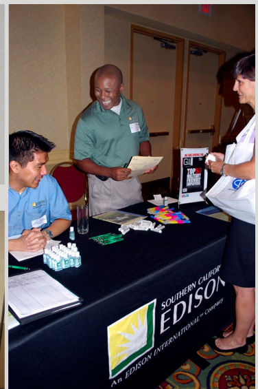
Southern California Edison