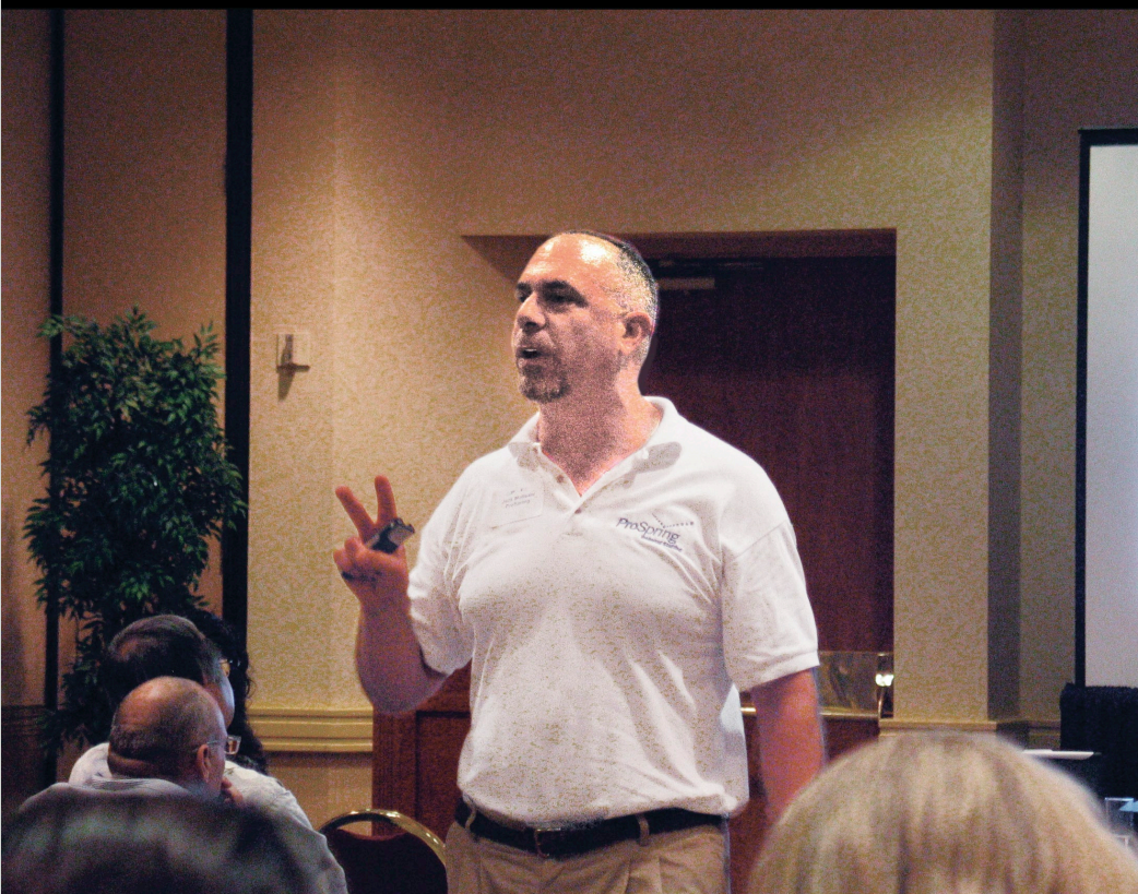
CAREER FAIR BREAKOUT SESSION 3