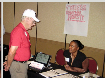
SS&J Parish Career Renewal