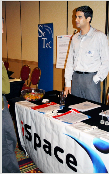
iSpace, Gold Event Sponsor