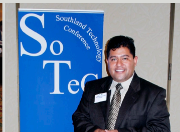
Southland Technology Conference