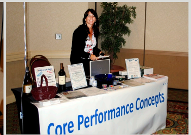
Core Performance Concepts